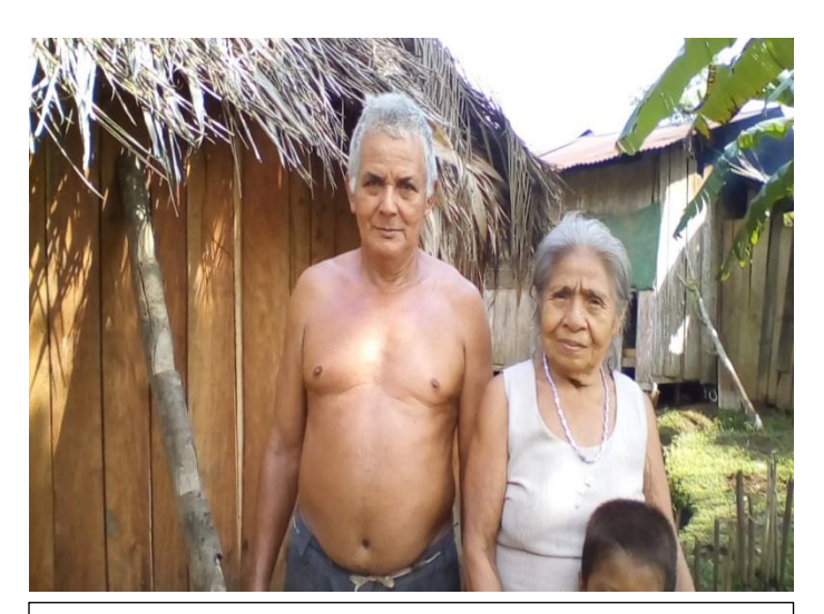
"We've been together now over 50 years and have decided to get married and make commitments to serve the Lord for the rest of our life." This couple is in one of our house churches.