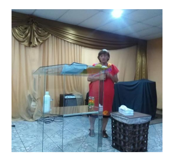
I've had the privilege of teaching in several countries in a good number of churches on many subjects, but mostly on Christ's calling to complete commitment and to missions.

I administer the farm, write children's lessons, coordinate boats, gas and repairs, etc., and teach and preach in between. I write the Sunday school lessons which are passed from leader to leader. For each lesson I find illustrations, memory verses, an application and a craft. I also write the lessons for home Bible Studies since they must be appropriate for the reading level of those in this area.