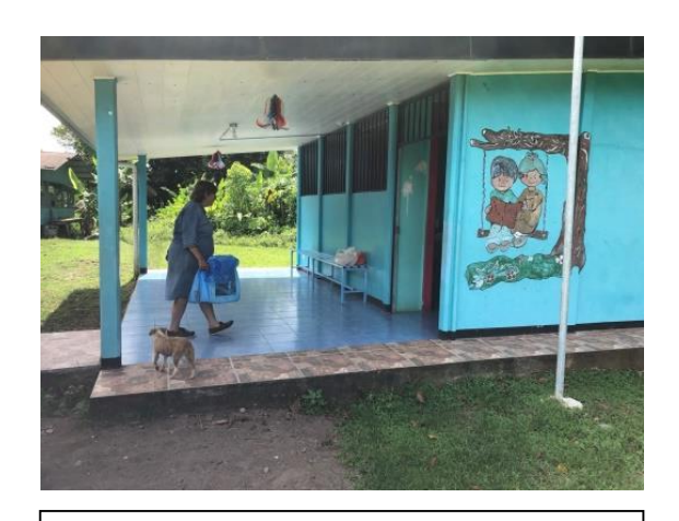
Ana heading into one of the larger schools for church services.