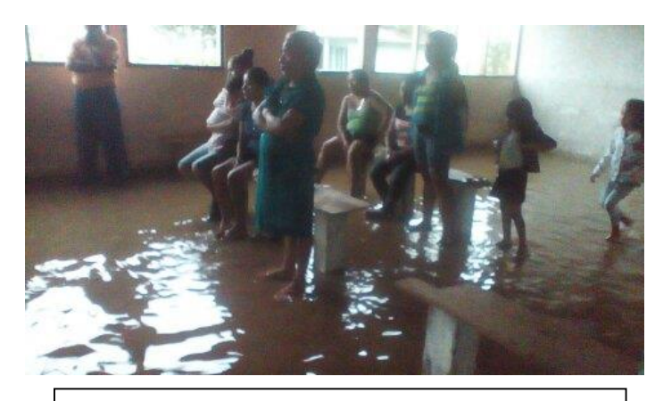
Church services continue in an old school loaned to us in spite of the unexpected and continued flooding we experienced.